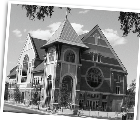
The Gator Wesley Center